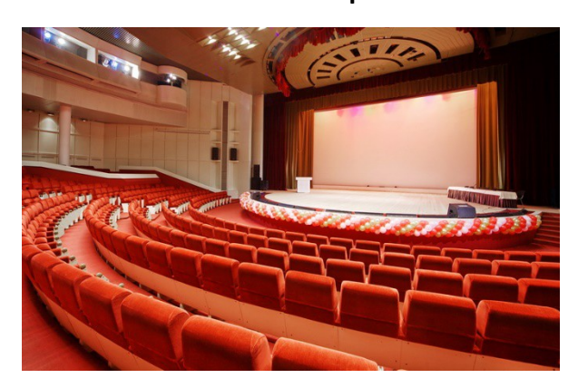
Accommodation: Welcome to Saint-Petersburg Hotel

The Saint-Petersburg Hotel is located in the historical center of the city, on the main Neva River Embankment and is suitable for all kinds of visitors, both leisure and business. In addition, we pride ourselves on offering the best view of the St. Petersburg historical city center.