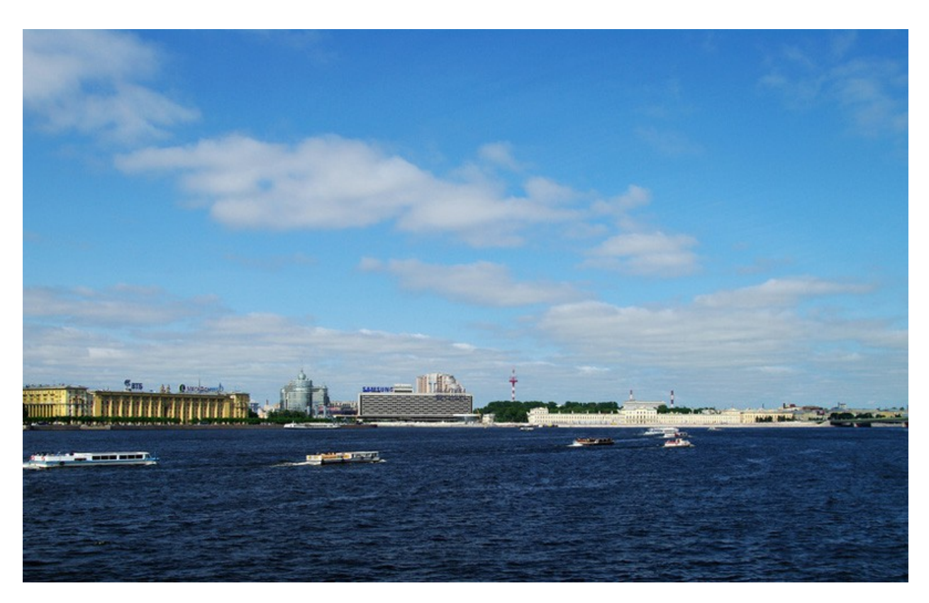
Here is the hall for the competition